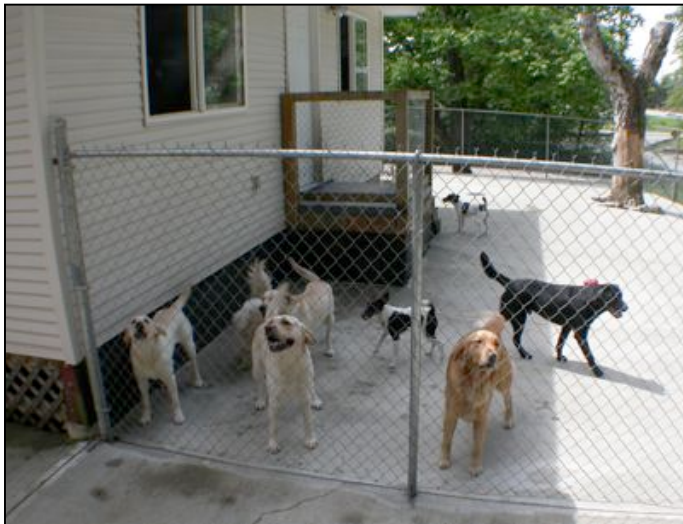
Dogs in Advanced Training, PADS Campus. Chase shoulders his way nonchalantly through his boisterous Yellow Lab friends – Sable , Jasper and Stella – to get to the fence.